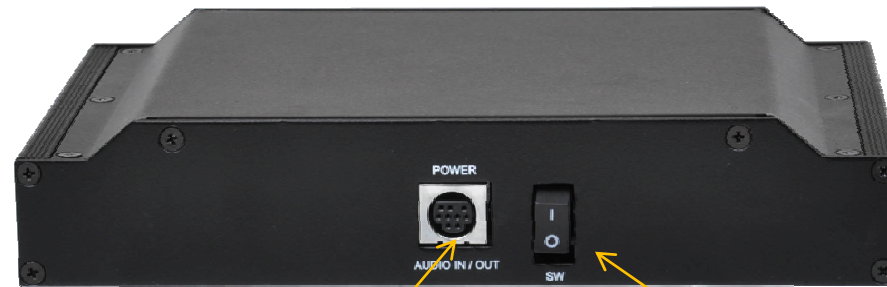
Audio Out & Power In Connector