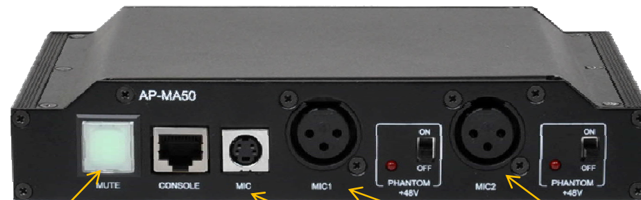
Audio Mute Button & LAMP