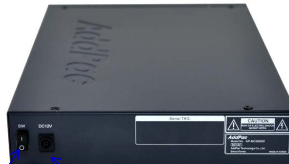
Power On/Off Switch