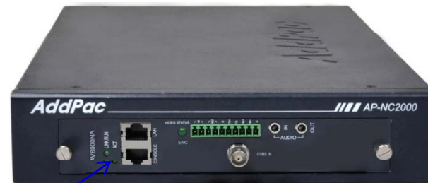
AV6000NA D1 Video Codec Module