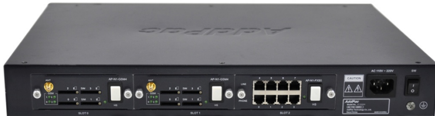
AP-GSM2000 (4-Port GSM Module x 2 + 8-Port FXS Module)